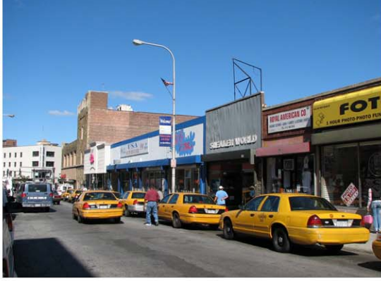
New Main streetscape looking northeast.jpg