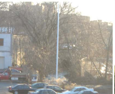
46 Elm Street bw side.jpg