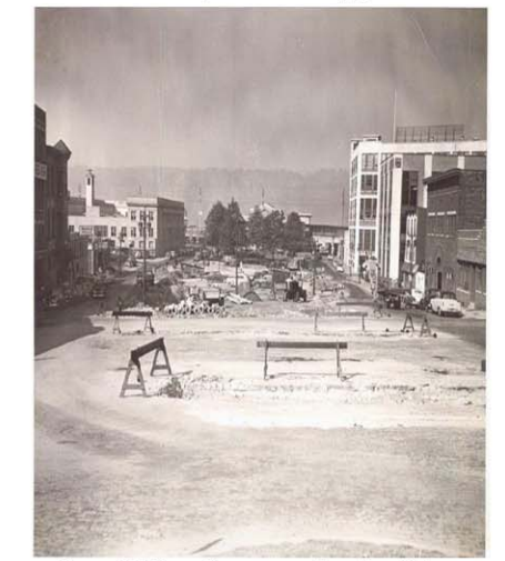
Sawmill River flume construction 2.bmp