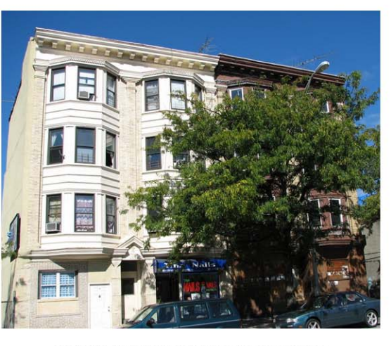
193-195 Nepperhan Ave looking north.jpg