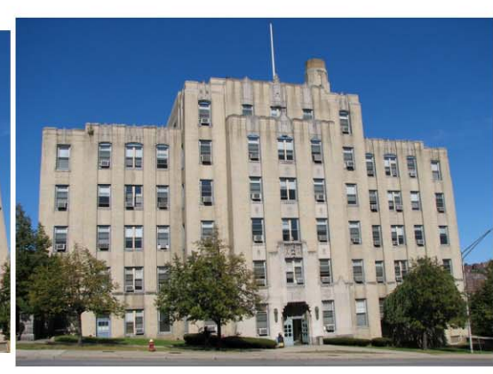
87 Nepperhan Ave looking north.jpg