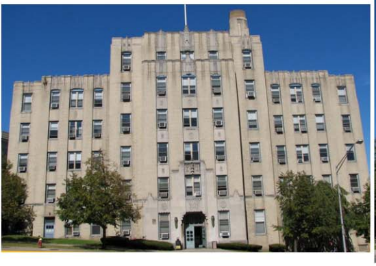
87 Nepperhan Ave looking north 2.jpg