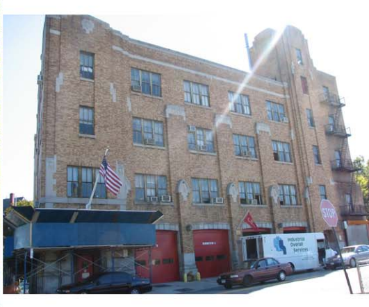
5-7 New School Street looking south southwest...