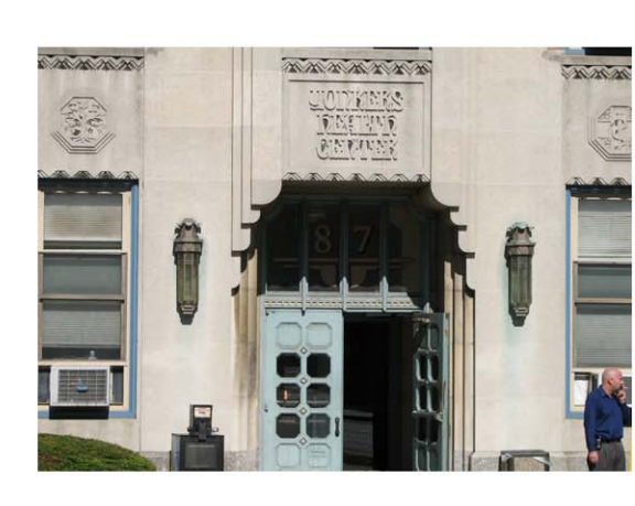
87 Nepperhan Ave close up of door2.jpg