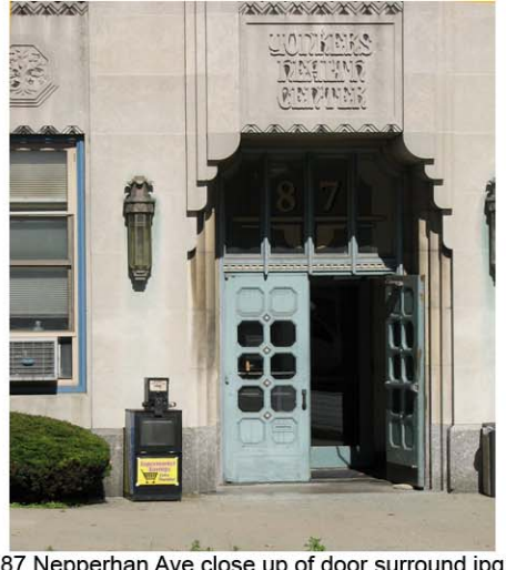
87 Nepperhan Ave close up of door surround.jpg