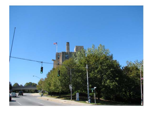
longhsot of 87 Nepperhan looking west northwe...