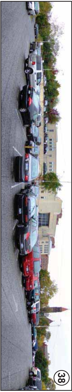
Exhibit III.B-1i EXISTING CONTEXT CACACE CENTER