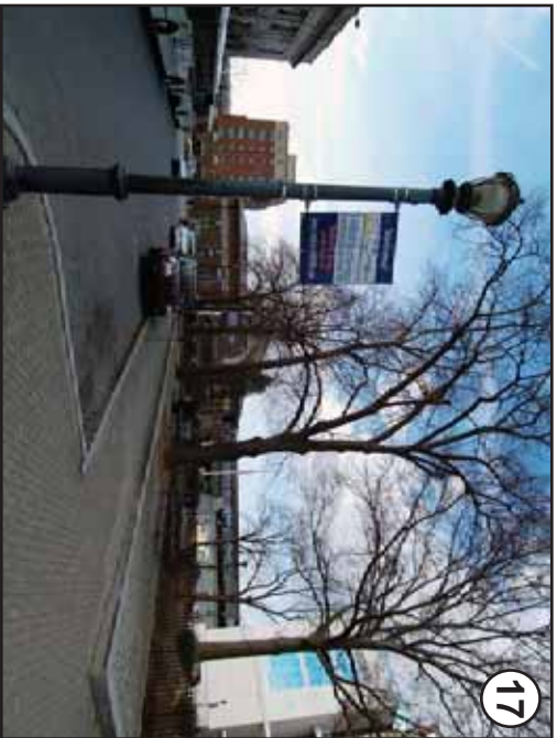
Exhibit III.B-1n EXISTING CONTEXT LARKIN PLAZA