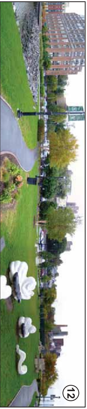
Exhibit III.B-1m EXISTING CONTEXT PALISADES POINT