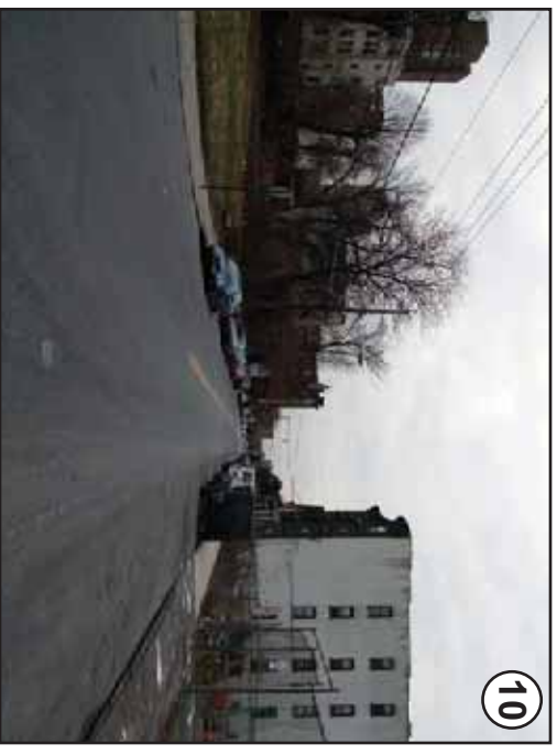
Exhibit III. B-11 EXISTING CONTEXT PALISADES POINT