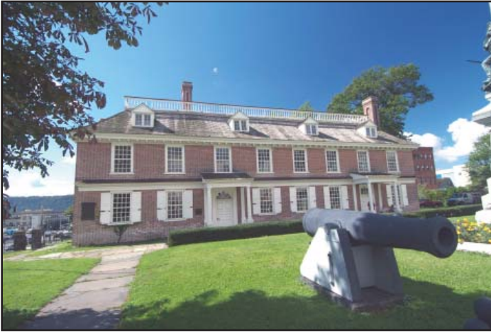
Philipse Manor Hall: Warburton Avenue and Dock Street