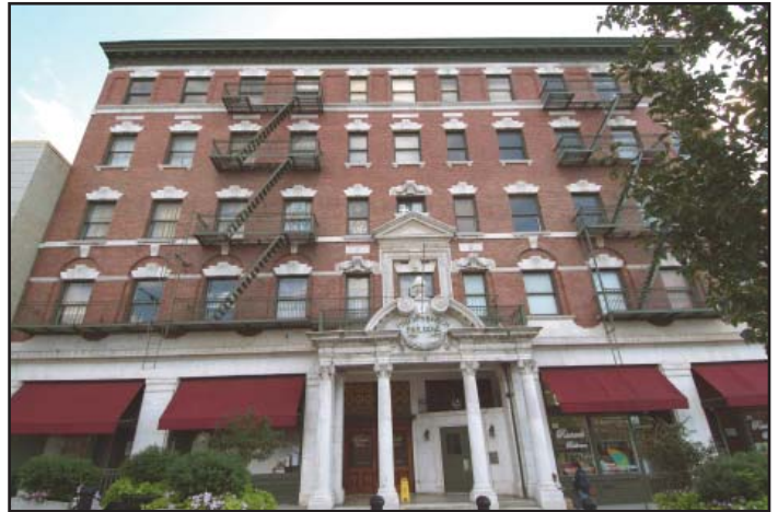
Phillipsburg Hall Building: 2-8 Hudson Street