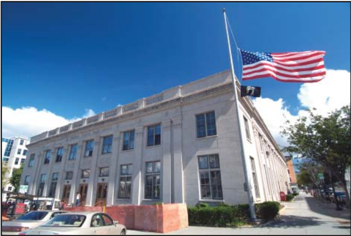
U.S. Post Office: 79-81 Main Street