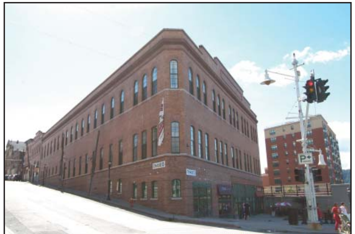
Yonkers Trolley Barn: 92 Main Street