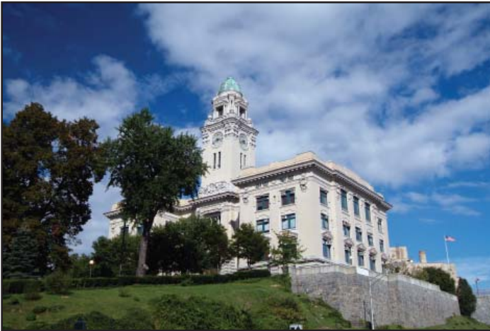
Yonkers City Hall: 40 South Broadway