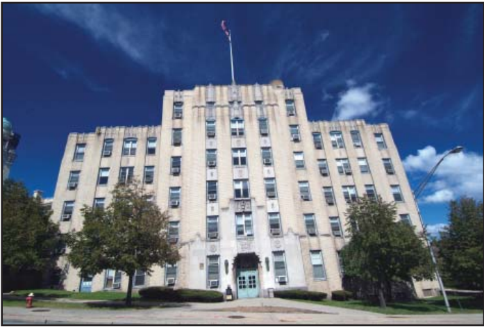
City Office Building: 87 Nepperhan Avenue