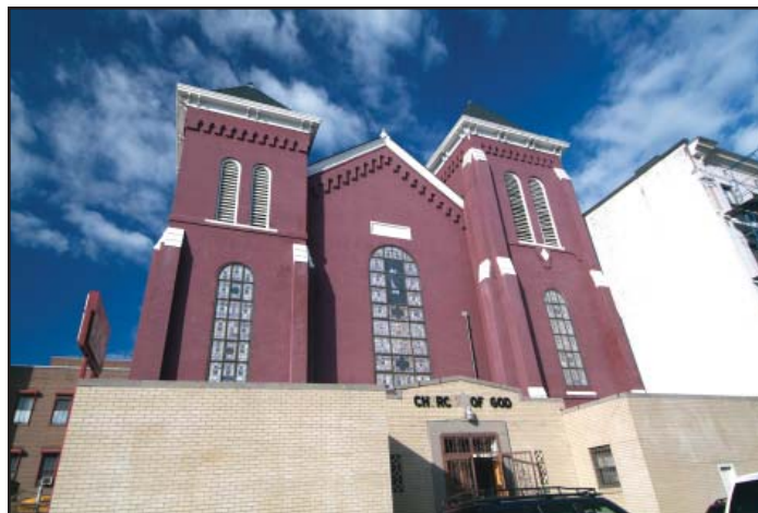
Yonkers Church of God: 21 Hudson Street