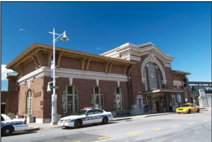
Yonkers Railroad Station: Buena Vista Avenue and Nepperhan Avenue