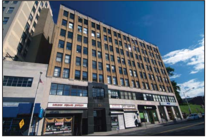
30-38 South Broadway