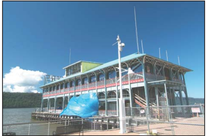
Yonkers Recreation Pier: Main Street and Hudson River