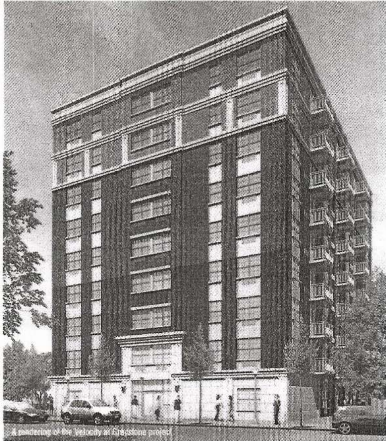
A rendering of the Velocity at Greystone project.

• Struever Fidelco Cappelli L.L.C. (SFC) — The $1.5 billion phase one of the company's Yonkers Redevelopment Plan is made up of four projects — River Park Center, the Riverwalk, Larkin Square Daylighting and Palisades Point. River Park Center will be a more than 2 million-square-foot mixed-use complex with retail, residential and office space, as well as an entertainment component and a minor league ballpark. The Cacace Center will be a complex of government offices, a 150-room hotel, fire department headquarters and a parking facility. Palisades Point will have two 25-story residential buildings and 9,000